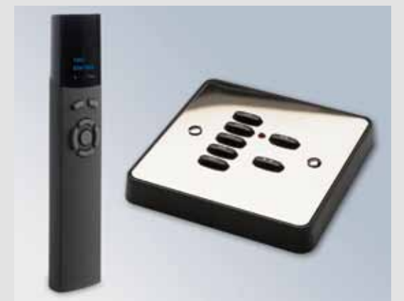
Remote controls Silent Gliss 0450

Our Customer Services team will be on hand from the start to offer expert advice on the most appropriate systems, control combinations and wiring for your project.