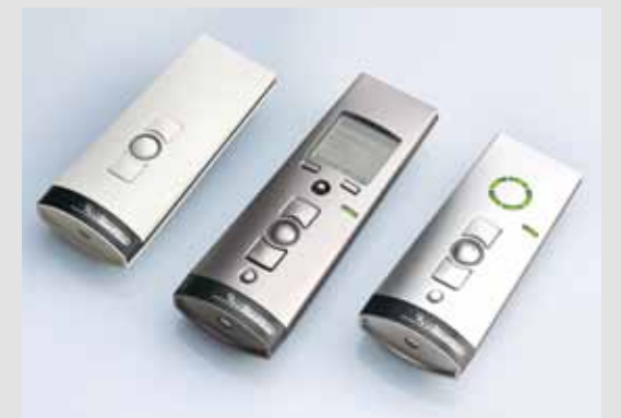
Remote controls Silent Gliss 9940