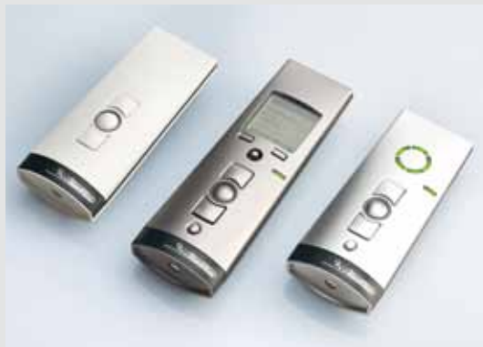
Remote controls Silent Gliss 9940